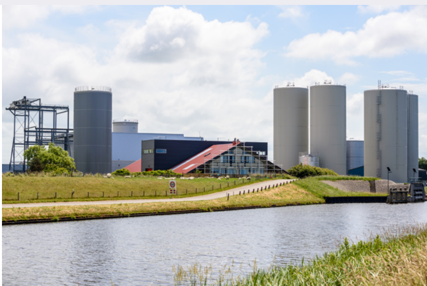
Factory in the Netherlands